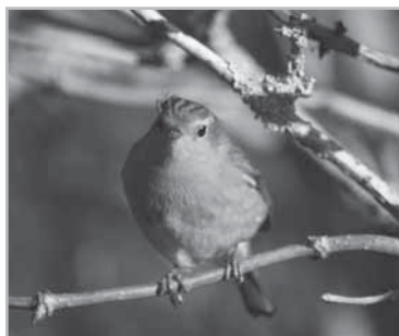
European Robin— Erithacus rubecula

I wonder about the reason that "why" has lost its meaning and energy for me. Perhaps it's because I've suffered.