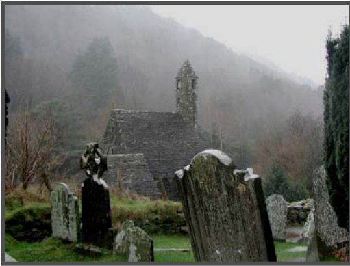
St. Kevin's Church, Glendalough